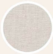
Crypton Nomad Snow