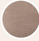
Crypton Nomad Taupe