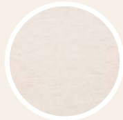
Crypton Nomad Snow