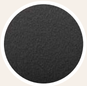
Fiqa Boucle Charcoal