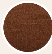
Crypton Wayfarer Sienna

See more Crypton styles at FourHands.com/Crypton .