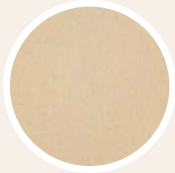
Fiqa Boucle Light Taupe