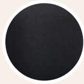
Fiqa Boucle Slate