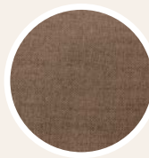
Crypton Nomad Mushroom