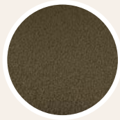
Fiqa Boucle Olive

See more Fiqa styles at FourHands.com/fiqa .