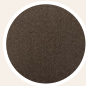
Fiqa Boucle Cocoa