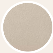
Fiqa Boucle Natural