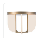
SF336816VB Vintage Brass

*For complete warranty terms, please visit: www.aloralighting.com/warranty