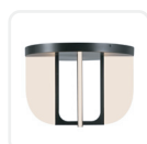
SF336816UB Urban Bronze