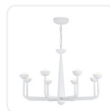
CH313830AW Antique White