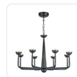
CH313830UB Urban Bronze