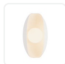
WV305105AW Antique White