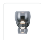
WV310205UBSM Urban Bronze/ Smoked Glass