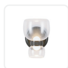
WV310205UBCL Urban Bronze/Clear Glass