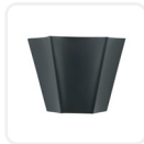
WV595209MB Matte Black

*For complete warranty terms, please visit: www.aloralighting.com/warranty