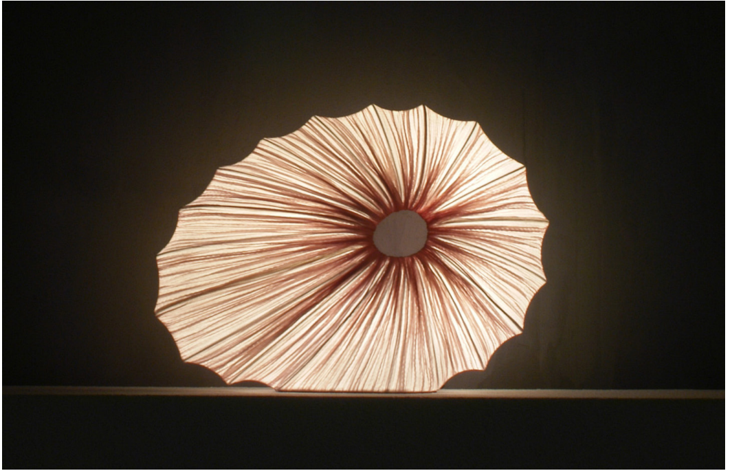
Viola Designed by Aqua Creations