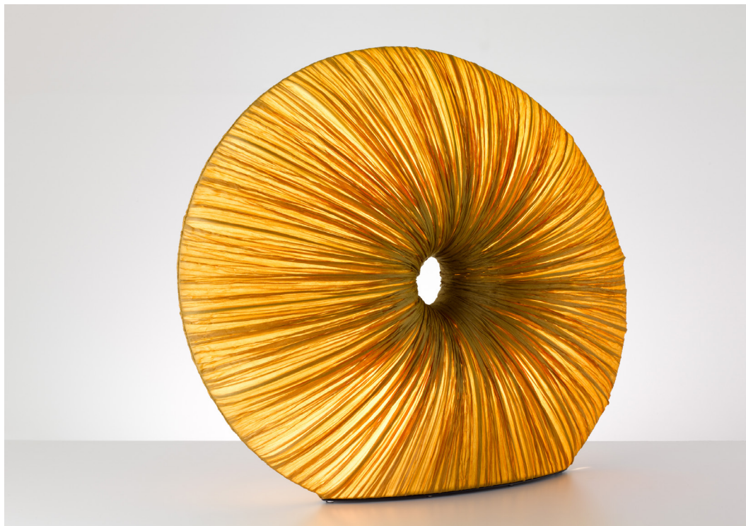
Rigua Designed by Aqua Creations