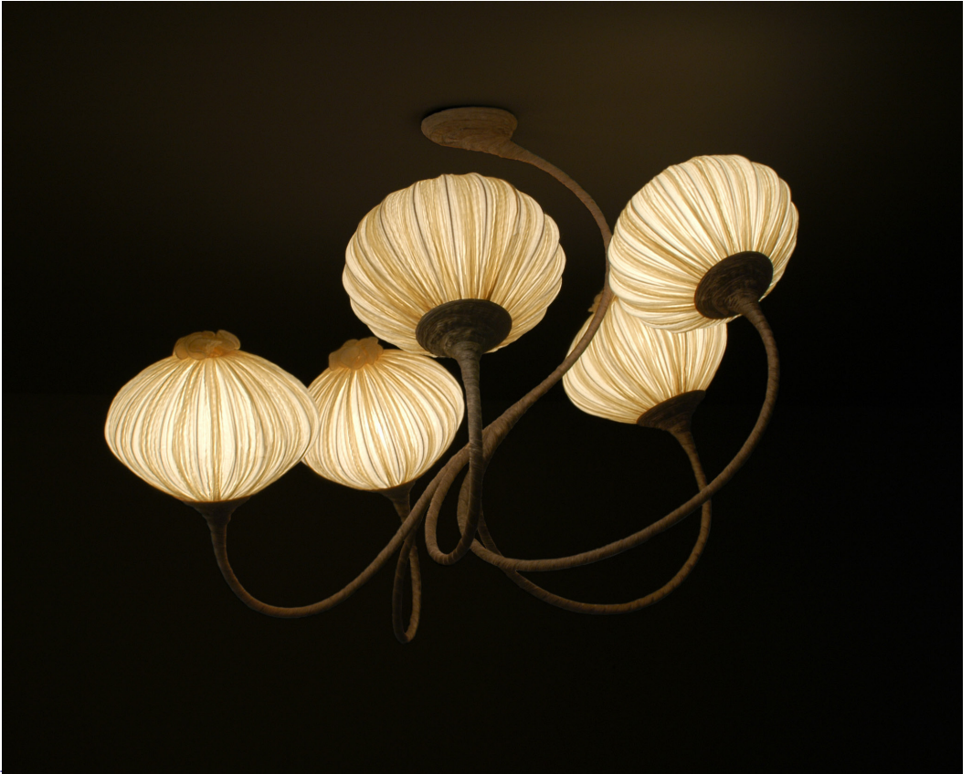
5 Palms Designed by Aqua Creations