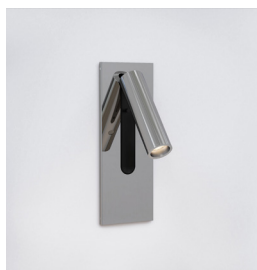
CODE: 1215112 FINISH: POLISHED CHROME