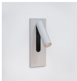
CODE: 1215110 FINISH: MATT WHITE