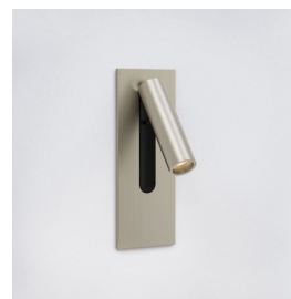
CODE: 1215113 FINISH: MATT NICKEL