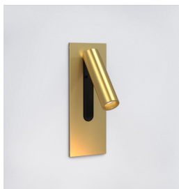
CODE: 1215114 FINISH: MATT GOLD