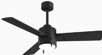
SS-BK-BK-42 Matte Black Finish with 42" Matte Black Blades