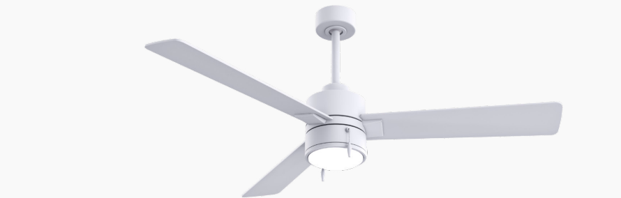
SS-MWH-MWH-52 Matte White Finish with 52" Matte White Blades