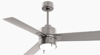
SS-BN-BN-42 Brushed Nickel Finish with 42" Silver Blades