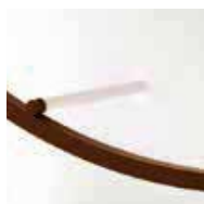
wall or ceiling details