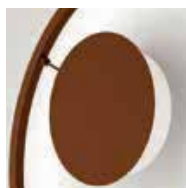
wall or ceiling lamp canopy version