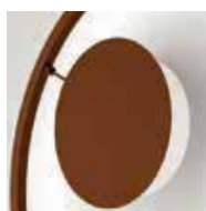
wall or ceiling lamp canopy version