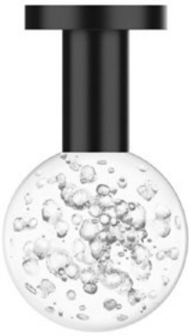
SP2 CANOPY MOUNTING OPTION (DRIVER SOLD SEPARATELY)