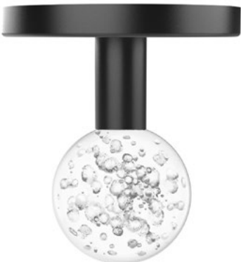
SP5 CANOPY MOUNTING OPTION (INTEGRATED DRIVER)