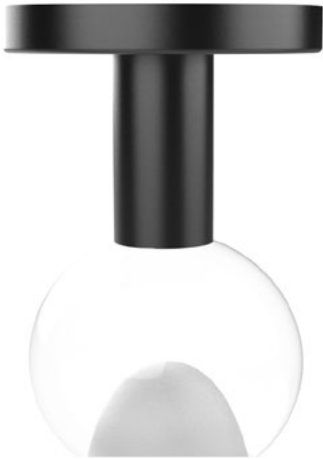
SP5 CANOPY MOUNTING OPTION (INTEGRATED DRIVER)