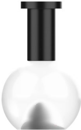
SP2 CANOPY MOUNTING OPTION (DRIVER SOLD SEPARATELY)