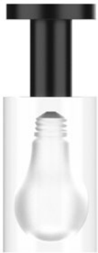
SP2 CANOPY MOUNTING OPTION (DRIVER SOLD SEPARATELY)