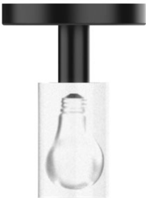
SP5 CANOPY MOUNTING OPTION (INTEGRATED DRIVER)