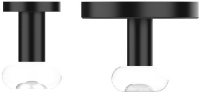
SP2 CANOPY MOUNTING OPTION (DRIVER SOLD SEPARATELY)