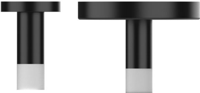
SP2 CANOPY MOUNTING OPTION (DRIVER SOLD SEPARATELY)