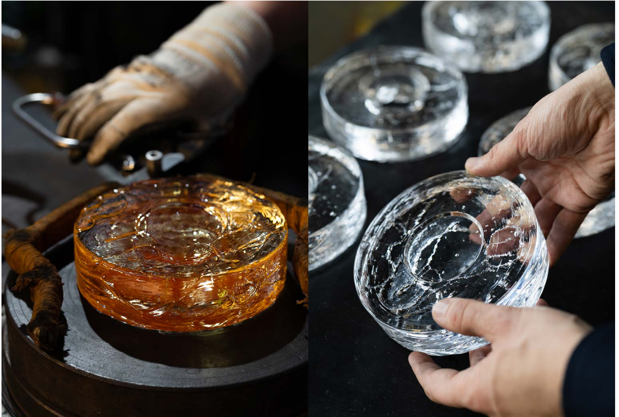
Each Ollo portable lamp has it's own unique structure of the glass.