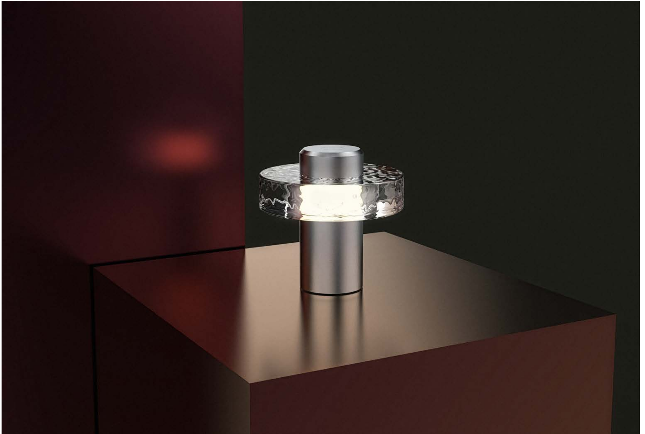
Portable lamp Ollo in brushed silver fitting