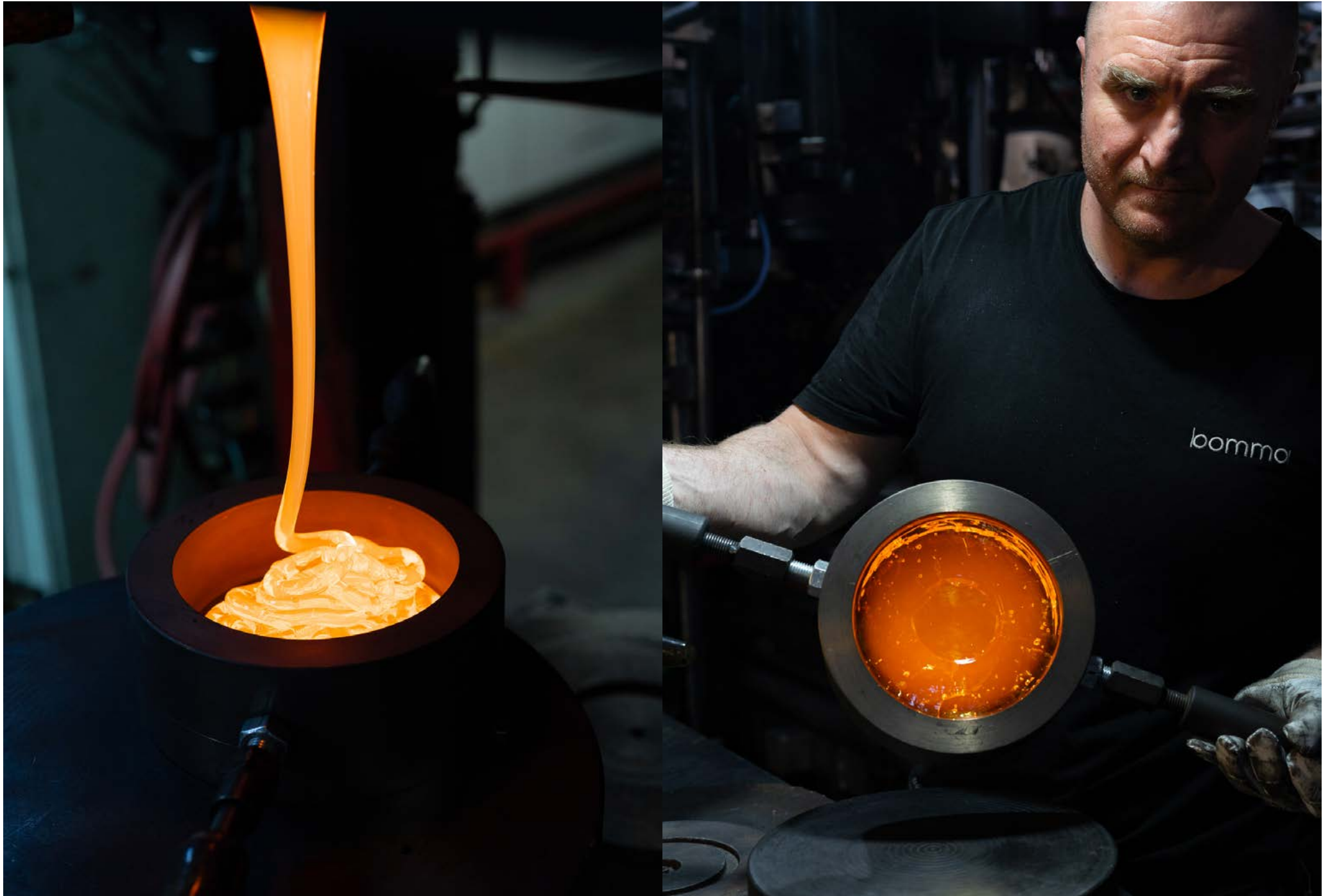
Crystal glass is poured into the mould and then pressed.