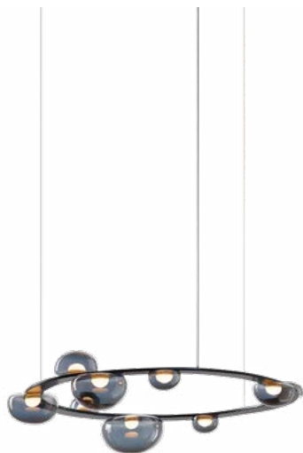
brushed black smoke metalization