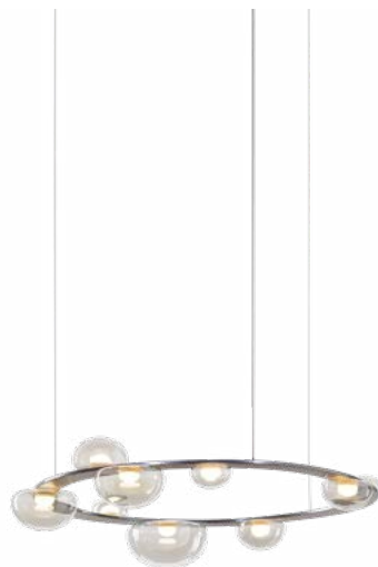
brushed silver iridescent metal-coating