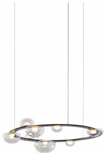
brushed black iridescent metal-coating