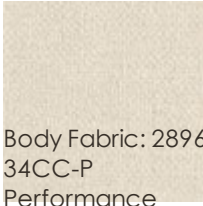
Body Fabric: 2896- 34CC-P Performance