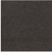
Body Fabric: 2892-71CC