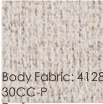
Body Fabric: 4128- 30CC-P Performance