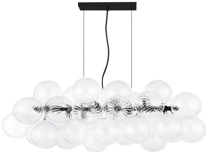
10 Light Halogen Horizontal Pendant Matte Black with Clear Spiral Glass

Height 15.75 Width/Length 41 Depth 16.25 Weight 12.5