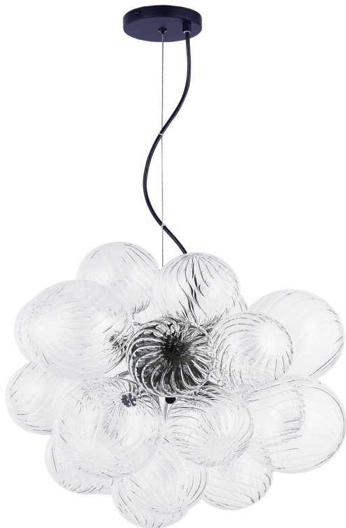
6 Light Halogen Pendant Matte Black with Clear Spiral Glass

Height 20 Width/Length 20 Depth 20 Weight 6.5