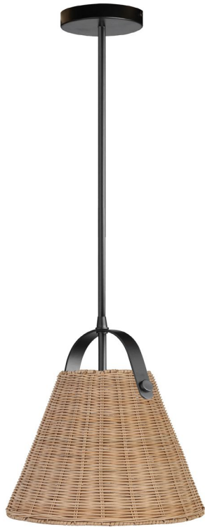
1 Light Incandescent Pendant Matte Black with Wicker Shade

Height 14 Width/Length 13 Depth 13 Weight 2