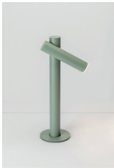
TIK_4096X Page 4