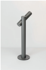
TIK_4097X Page 4