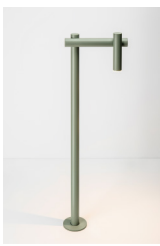
TIK_4099X Page 4