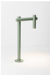
TIK_4098X Page 4