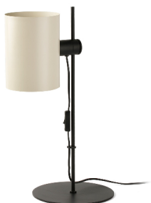
Table lamp with a cylindrical shape in beige finish designed by Faro Lab . A unique design to give a modern touch to any space. Allows the light to be directed more firmly. Black structure.