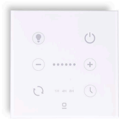
White wall controller for DC fan with dimmable light