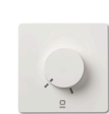
Wall controller white rf applique 6 speeds