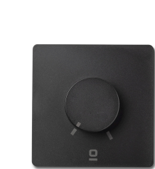
Wall controller black rf applique 6 speeds