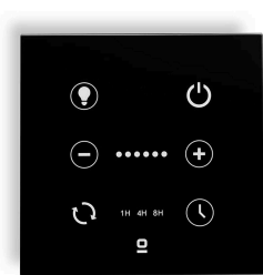
Black wall controller for DC fan with dimmable light