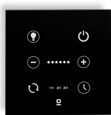
Black wall controller for DC fan with dimmable light