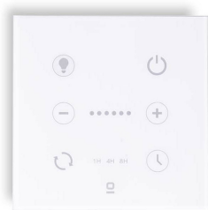
White wall controller for DC fan with dimmable light