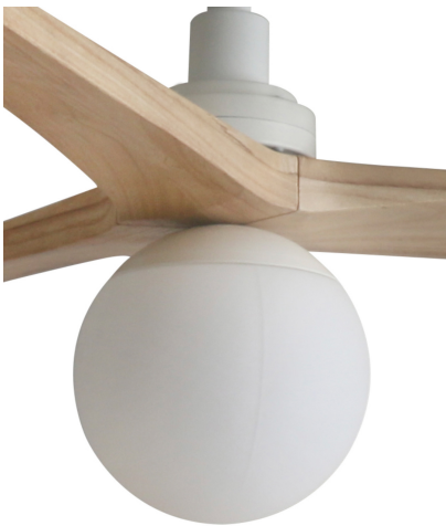
Light kit white for KLIM