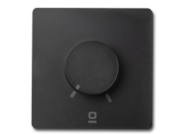
Wall controller black rf applique 6 speeds