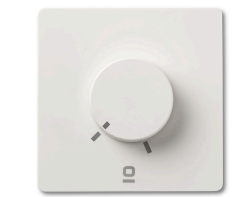
Wall controller white rf applique 6 speeds