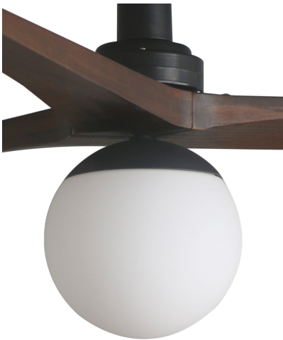
Kit de luz black para KLIM E27