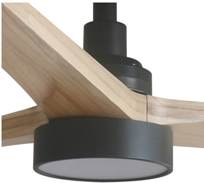
TAKI Light kit black SWT 20W dimmable