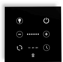
Black wall controller for DC fan with dimmable light