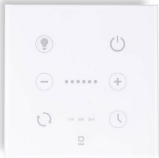
White wall controller for DC fan with dimmable light