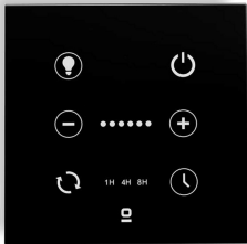
Black wall controller for DC fan with dimmable light