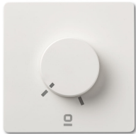
Wall controller white rf applique 6 speeds