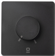
Wall controller black rf applique 6 speeds