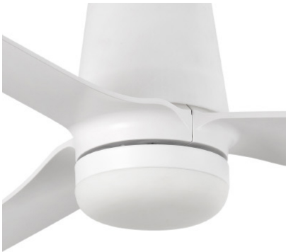
PUNT 2024/TUB Light kit white SWT 18W dimmable