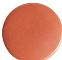
1 x Ceramic APO