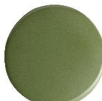
1 x Ceramic VSA