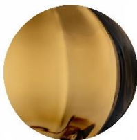
2 x Glass BRO