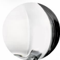
2 x Glass CRI