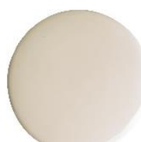
1 x Ceramic CRM