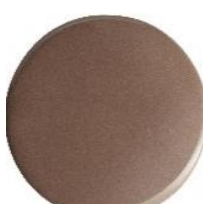
1 x Ceramic MOK