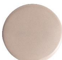
2 x Ceramic GRS