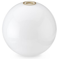
F3137059 IC Lights 2 diffuser for brass version