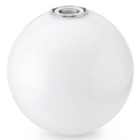
F3136057 IC Lights 1 diffuser for chrome version