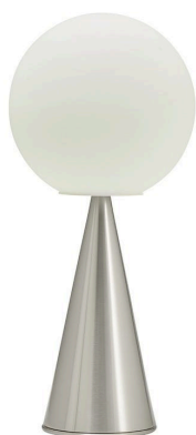
Table lamp with diffused light and dimmable by switch button. Frame made of brushed nickel-plated metal. Diffuser made of white blown glass with satin-finish. Transparent power cable, dimmer and plug. European two-pole plug. Bulb not included.

Nothing more than a sphere, set in an apparently impossible feat of balance, upon a cone that serves as the base. One of Gio Ponti's many compositional magic tricks, designed in 1932. The counterbalancing of two elementary geometric forms results in an original, perfectly proportioned object. An unpretentious composition, enriched by the extraordinary balance of its proportions and the stylish discretion of non-reflective materials. The light is diffused and valorized by the geometrical simplicity of the design. In designing Bilia, Gio Ponti imagined a smaller version in a range of "spray colours". From those handwritten notes of the original project, FontanaArte presents Bilia Mini in new breathtaking chromatic variations.