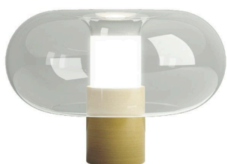
Table lamp with dimmable diffused light. Galvanized metal frame. Borosilicate blown glass diffuser. Transparent power cable, dimmer and plug. European type plug two poles. Light source not included.

Two materials: metal and glass, as in the historic tradition of FontanaArte. The metal acts as a base and contains the light source while the glass, the true protagonist of the project, is expertly worked by skilled craftsmen in a process of fusion between a portion of transparent glass and a satin one from which the light diffuses. Fontanella is formed by the union of two glasses: the internal tube is threaded, sandblasted and finally joined with the bubble-shaped blown glass. What makes the processing particularly refined is the manual joining of the two parts, which requires the skillful technique of a craftsman. Furthermore, the glass, which has always been the material par excellence of the FontanaArte product, is the most crystalline on the market. The use of light bulbs, dimmable and not dimmable, for the biggest energy saving, complete the contemporaneity of this FontanaArte piece.