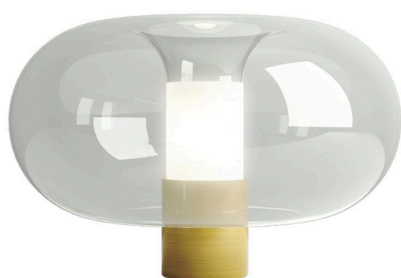
Table lamp with dimmable diffused light. Galvanized metal frame. Borosilicate blown glass diffuser. Transparent power cable, dimmer and plug. European type plug two poles. Light source not included.

Two materials: metal and glass, as in the historic tradition of FontanaArte. The metal acts as a base and contains the light source while the glass, the true protagonist of the project, is expertly worked by skilled craftsmen in a process of fusion between a portion of transparent glass and a satin one from which the light diffuses. Fontanella is formed by the union of two glasses: the internal tube is threaded, sandblasted and finally joined with the bubble-shaped blown glass. What makes the processing particularly refined is the manual joining of the two parts, which requires the skillful technique of a craftsman. Furthermore, the glass, which has always been the material par excellence of the FontanaArte product, is the most crystalline on the market. The use of light bulbs, dimmable and not dimmable, for the biggest energy saving, complete the contemporaneity of this FontanaArte piece.