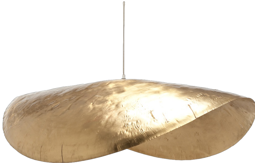
BRASS / SUSPENSION LAMP, Paola Navone

With a strong decorative impact, the BRASS lamp family exploits the ductility of brass and its ability to embellish interiors with warm and golden light reflections. Suspension lamps have a delicate shape of great visual appeal: a light brass disc with a slight curvature in the smaller version or very accentuated in the larger one that floats in the air reflecting light poetically and suggestively. They can be used individually or combined with each other for an even more suggestive and cinematographic effect.