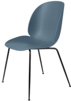
Beetle Dining Chair