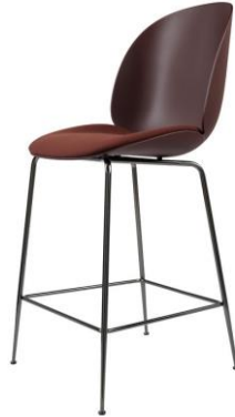
Beetle Counter Chair