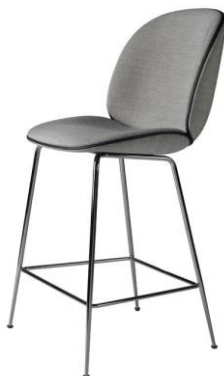
Beetle Counter Chair