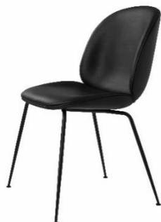
Beetle Dining Chair