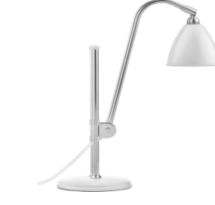
// White / Chrome