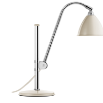
// Off-White / Chrome