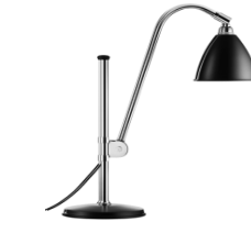
// Black / Chrome