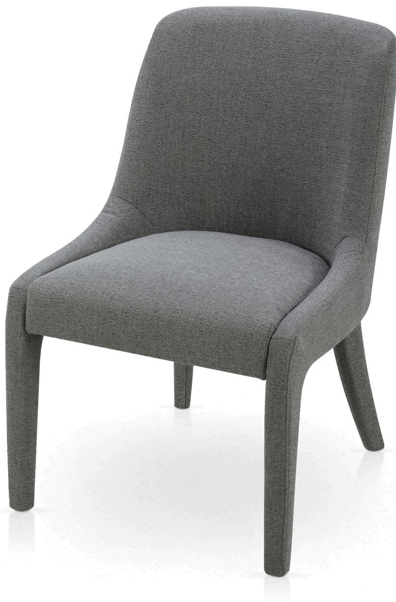
BENTON DINING CHAIR