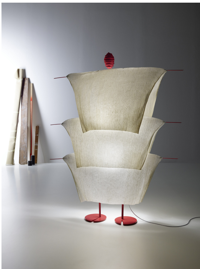
Walking In The Rain INGO MAURER UND TEAM 2017

Paper, metal, stainless steel, silicone. "Walking In The Rain" is a large, sculptural light object standing on two red feet. Three sheets of paper are arranged one above the other and remind of a cloak. The inspiration for this exclusive fixture comes from traditional Japanese raincoats woven from straw, which explains its appearance of a figure with feet and a head. Like all papers of the MaMo Nouchies series, the lampshade consists of Japanese paper, which is treated in several steps in Dagmar Mombach's factory until it reaches the desired shape. For Walking In The Rain a lot of the unique paper material is being used. Inside, two LED modules with a cooling element are installed. The module was developed by Ingo Maurer especially for the MaMo Nouchies. The light is warm and soft, and can hardly be distinguished from conventional halogen light. The paper sheets act as light diffusers. Walking In The Rain's friendly presence provides more than light.