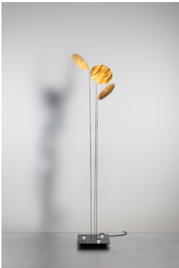
nuunu FLAVIA THUMSHIRN 2023