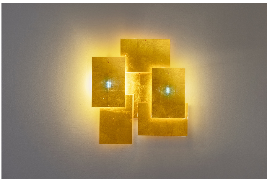
24 Karat Blau Flat AXEL SCHMID 2021

24 Karat Blau Flat is the latest member of the 24 Karat Blau family. The very flat wall light is based on an acrylic glass panel into which gold leaf is cast and which is mounted directly in front of the light source. The wafer-thin gold only allows short-wave blue light to pass through, so that the light point of the luminaire has a bluish shimmer. Warm, golden yellow light is reflected by the gold layer, creating a wonderfully warm atmosphere. One luminaire - many possibilities: With optional additional panels, which can be arranged and aligned in different ways as desired, 24 Karat Blau Flat can be transformed into an individual work of art. The luminaire was developed by Axel Schmid, who has been part of Ingo Maurer's creative team for more than two decades and has already designed the previous models in the series.