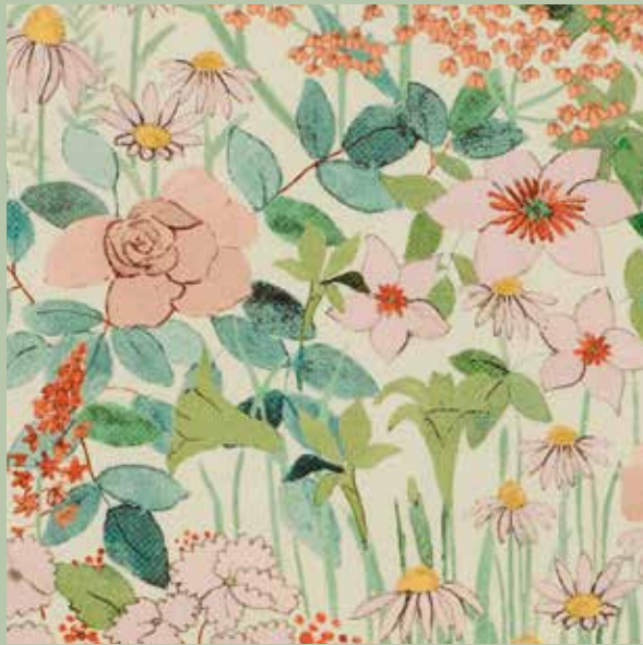
Flowers - BE Lichen