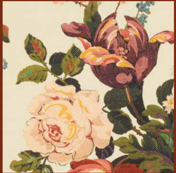
Flowers - XD Dragonfly